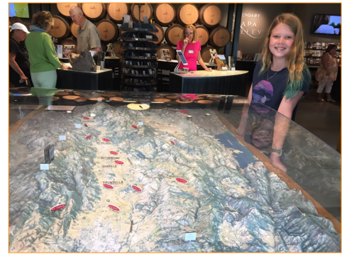
Terrain map/model of Napa Valley, California